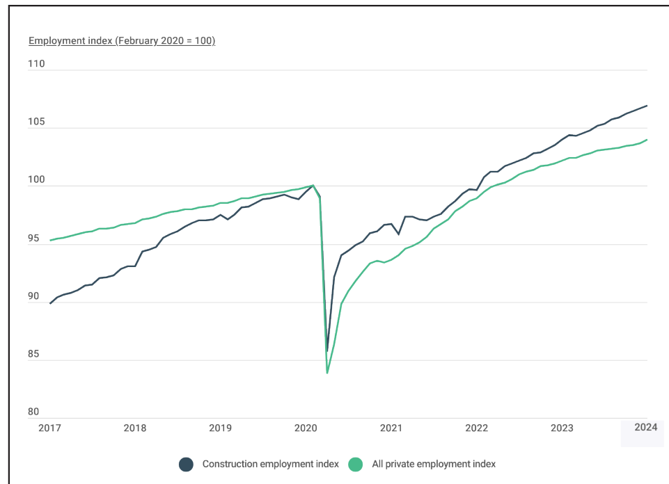
Source: Construction Coverage analysis of U.S. Bureau of Labor Statistics data | Image Credit: Construction Coverage

Below is a complete breakdown of the fastest-growing jobs in the construction industry across